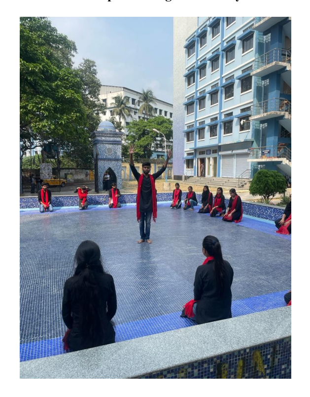
Students performing Community Media Performance on Menstrual Hygiene on 24 May 2023.