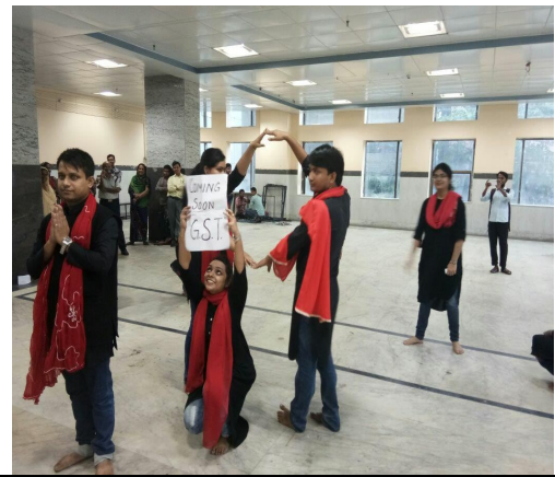
Nukkad Natak on Policy Issues on 17 Nov 2017