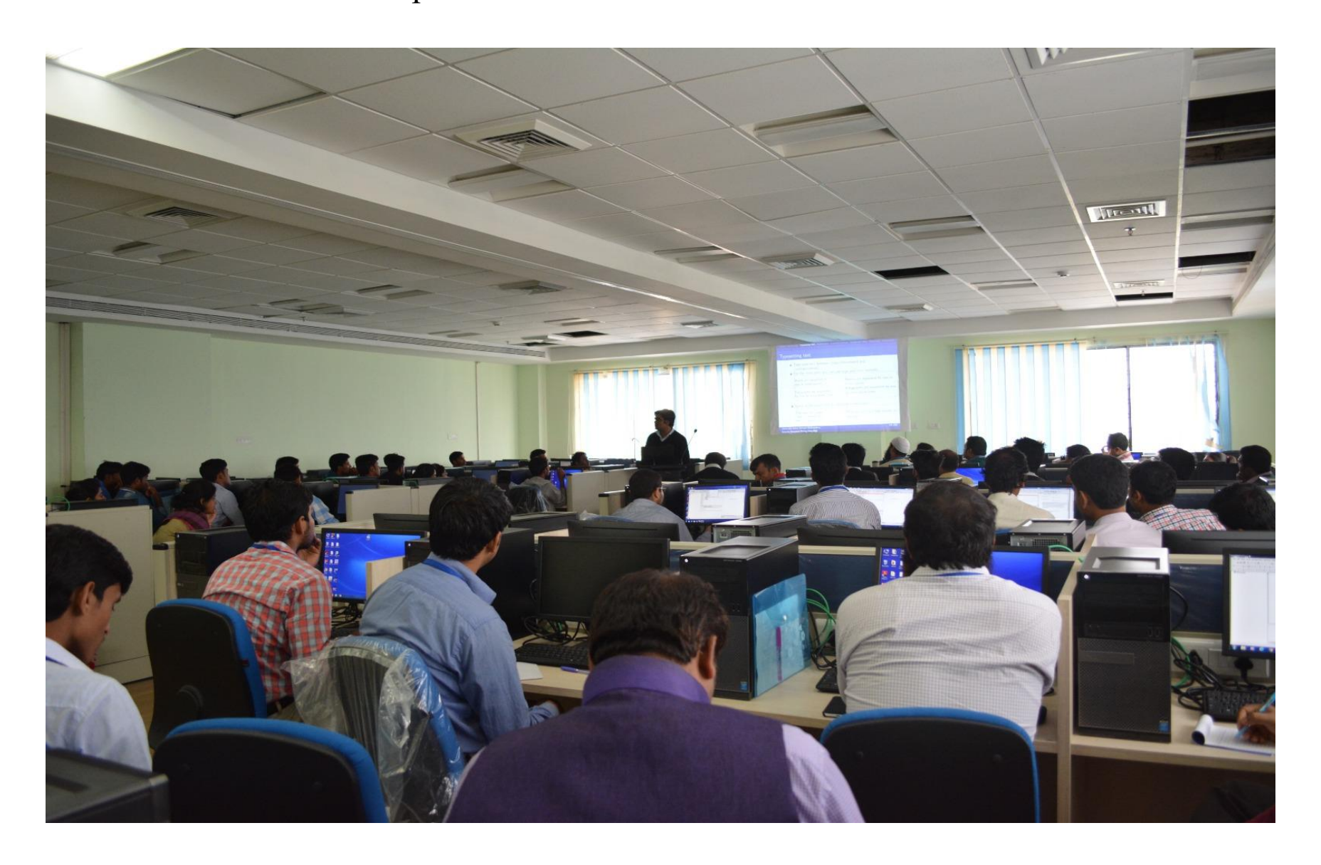
Hands on session (uses of Tool)