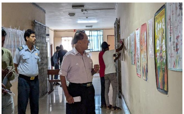
Photograph of Anti-Ragging Day and Anti-Ragging Week Celebration in 2024