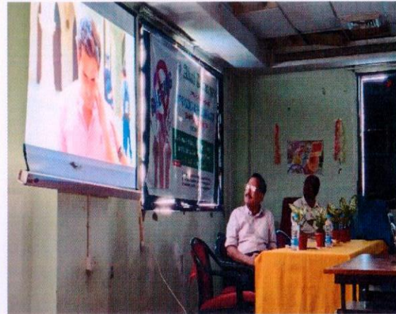
Photograph of documentary screening in Anti-Ragging Day celebration 2024