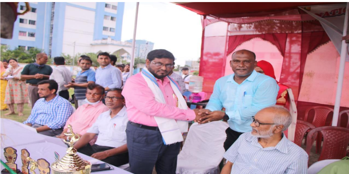
Thanks to all with Heartiest Co-operations.