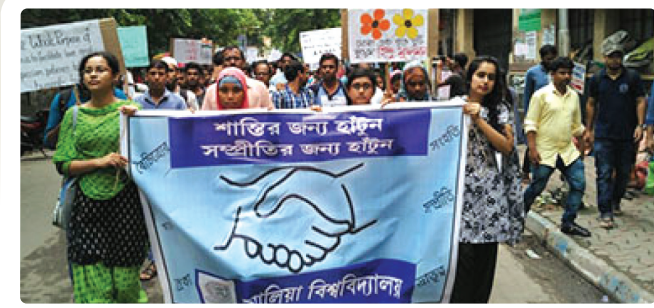
Walk for peace and communal harmony