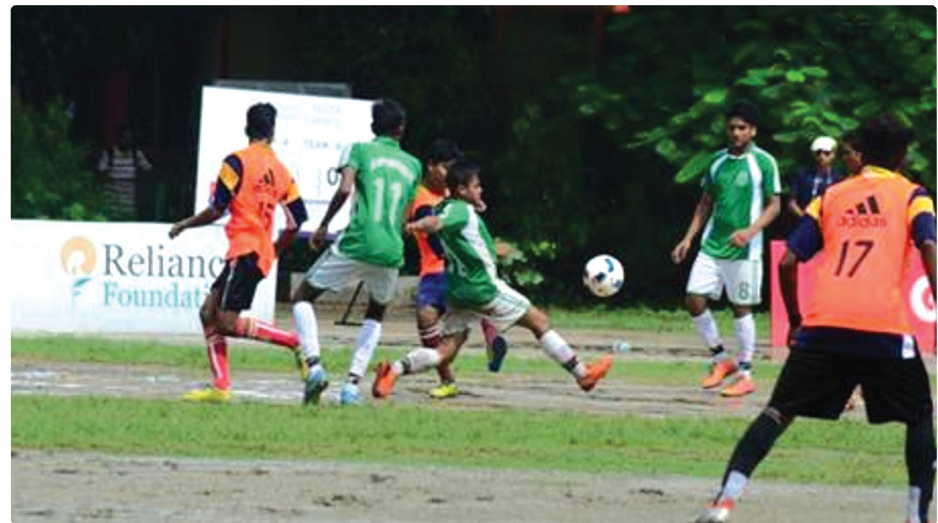
The game is on: Aliah University students taking part in a football tournament