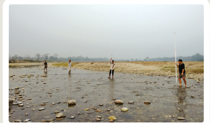
Students at field work, department of Geography