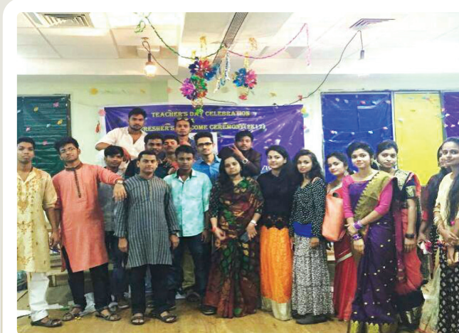
Celebrating Teachers Day