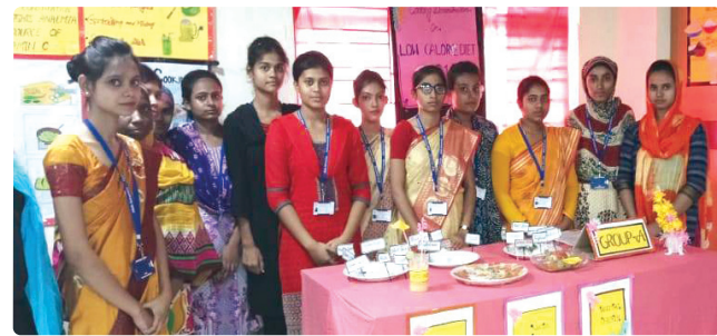
Students of Nursing with their project on Nutrition