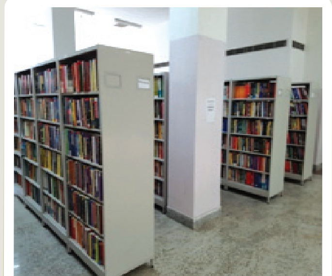
Library at the Newtown campus