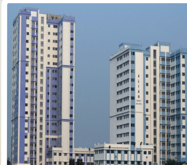
Hostels for boys and girls at Newtown campus