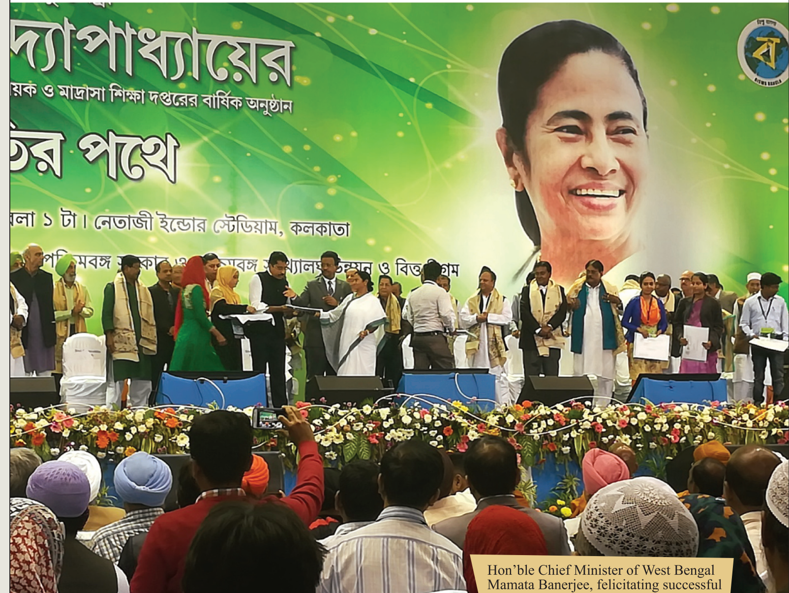
Hon'ble Chief Minister of West Bengal Mamata Banerjee, felicitating successful students of Aliah University

Each year Minority Affairs and Madrasah Education Department, Government of West Bengal organizes a programme in which issues related to the minority communities are addressed by Hon'ble Chief Minister Mamata Banerjee in presence of students and members of the communities. This year the programme took place on 5 December 2017 at Netaji Indoor Stadium. A major attraction of the event remains the felicitation of successful students from the minority communities of the state by