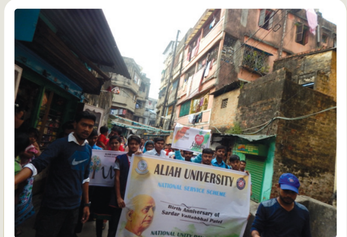
Students' rally on the occasion of birth anniversary of Sardar Vallabhbhai Patel