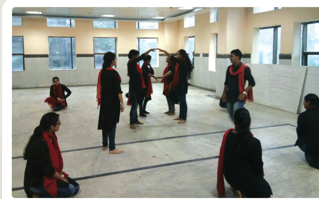
Nukkad Natak by the students of Journalism & Mass Communication