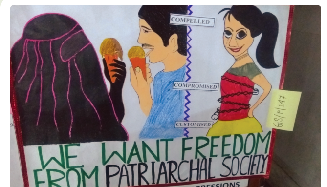
Award winning poster by the nursing students