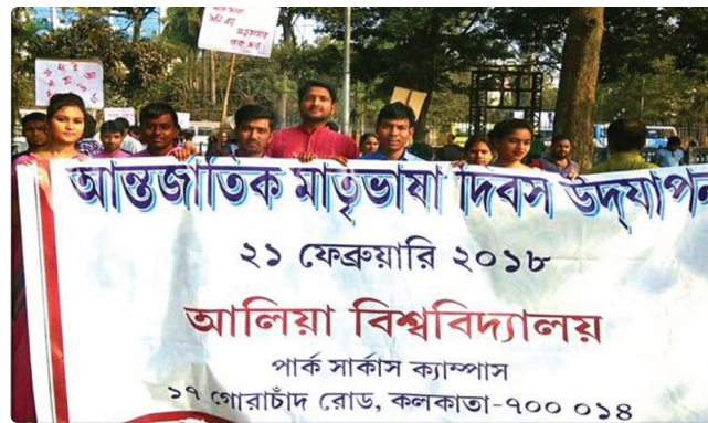
Celebrating the International Mother Language Day