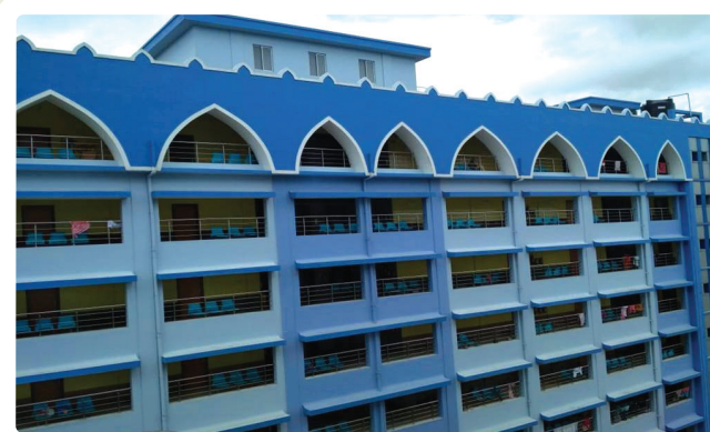
New 10 storied girl's hostel at Park Circus