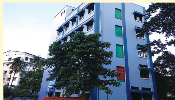
Amenity Centre, Park Circus

Students' Amenity Centres are almost ready in both Newtown (G+2) and Park Circus (G+4) campuses, and will soon be functional. Amenity centres will comprise Medical Centre, Common Room, Cafeteria, Swimming Pool, Squash Court, Gymnasium, Indoor games, Reprographic facilities, Stationery Outlet, Bank ATMs etc.