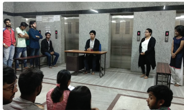
The Drama Club performing at the Park Circus campus