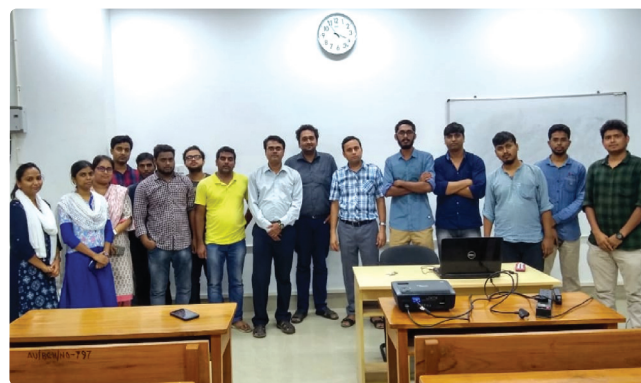
Students and faculty members of Physics department with an invitee