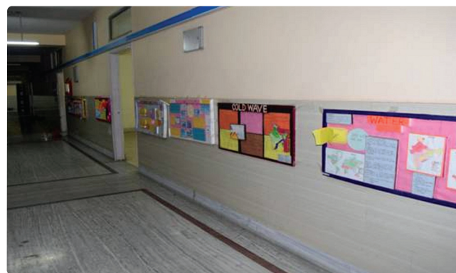
The wall and the magazine