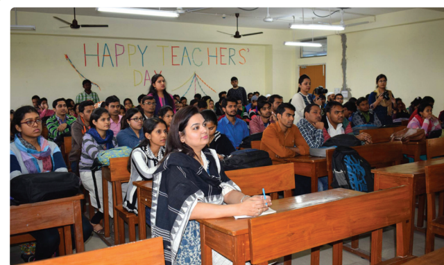
Students in interaction with a visiting resource-person