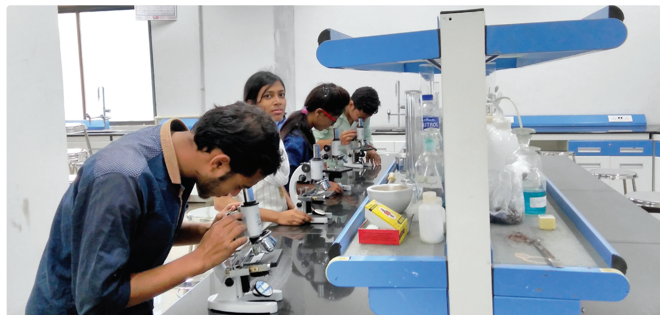
Doing the practicals