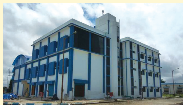
Amenity Centre, New Town