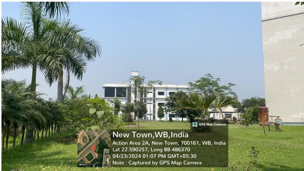
Figure 4 . Borewell in Aliah University, New Town Campus