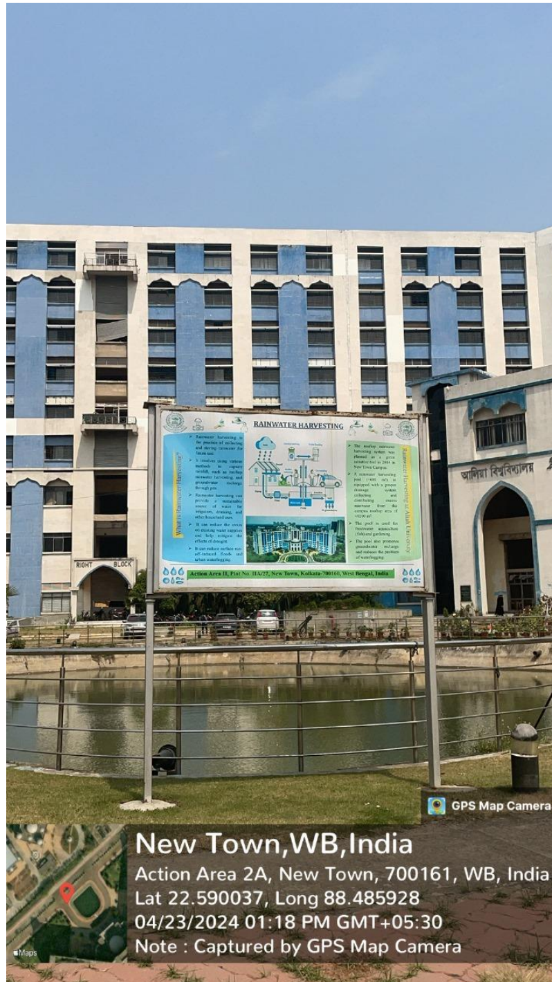
Figure 1. Rainwater Harvesting and Maintenance of water bodies and distribution system in the campus at Aliah University, New Town Campus