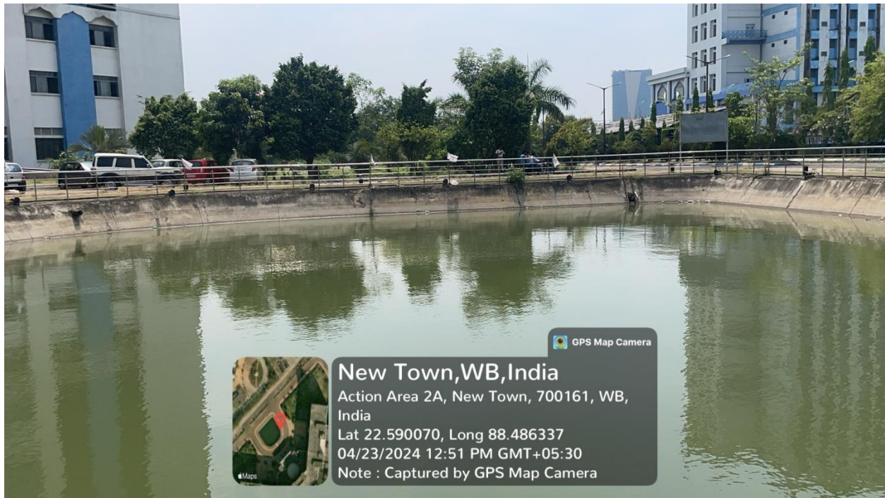
Figure 3 Maintenance of water bodies and distribution system in the campus at Aliah University, New Town Campus