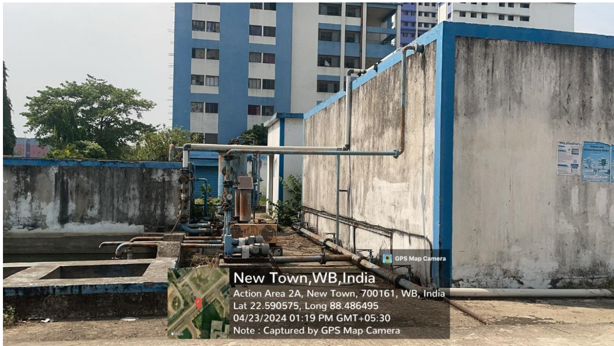
Figure 2. Waste Water Recycling at Aliah University , New Town Campus