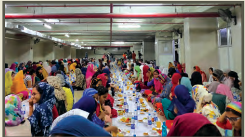
Iftar Majlish held on 27 April