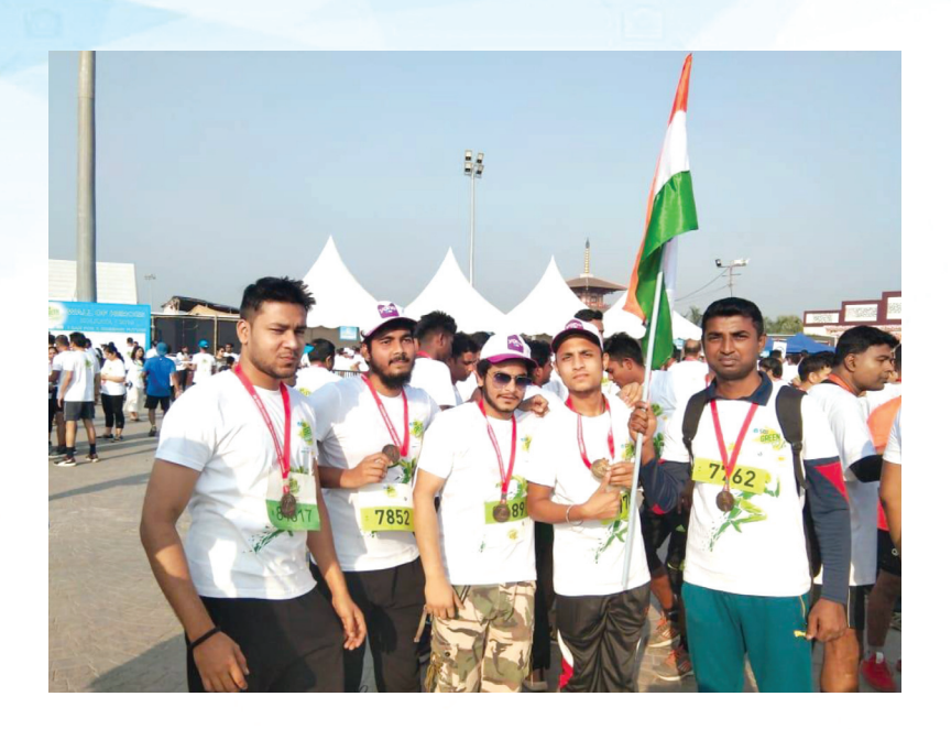
NSS Programme Officer, NSS volunteers and students of Aliah University participated in a Green Marathon organised by SBI on 24 February, 2019