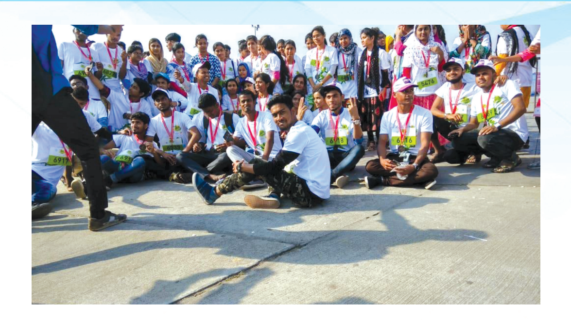
NSS volunteers and students of Aliah University in the Green Marathon organised by SBI on 24 February, 2019