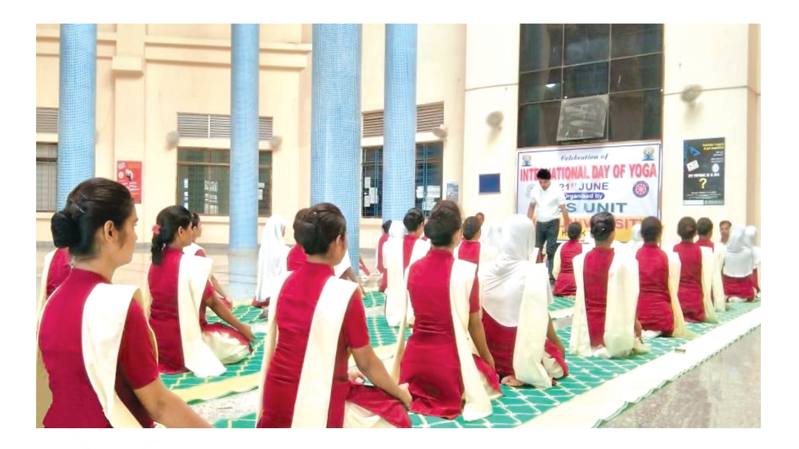
Yoga Teacher and participants performing Yoga during International Day of Yoga on 21 June, 2019

Performing Yoga during International Day of Yoga on 21 June, 2019